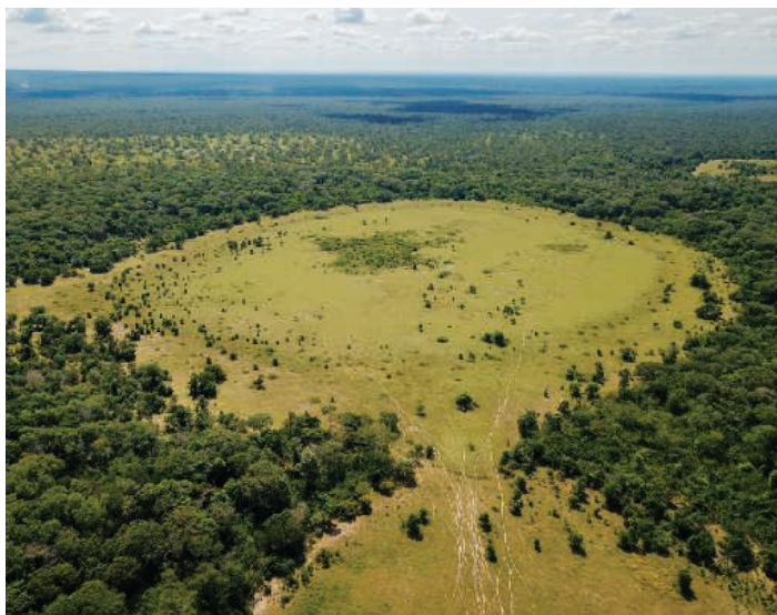
A large fairy circle in Brazil that leaks hydrogen is curiously devoid of vegetation.

Now, South Australia is in the middle of a hydrogen boom, at least on paper. The state is blessed with favorable geology. It's covered by the ancient Gawler Craton, and its iron and uranium mines point to the source rocks needed for both serpentinization and radiolysis. With the ocean so