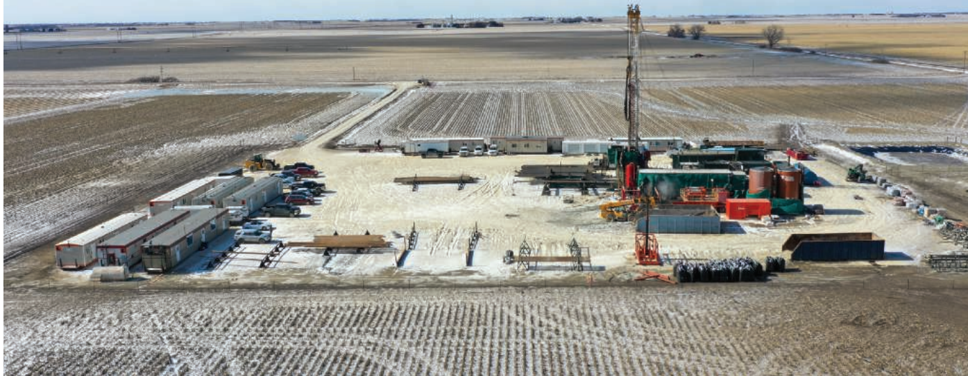
In 2019, the startup Natural Hydrogen Energy drilled the first U.S. hydrogen well amid corn and soybean fields in Nebraska.

within reach, he says, hydrogen could be collected from them directly, like oil from fracked shale; water could even be injected into the iron-rich rock to stimulate production. While collecting hydrogen, the well could also tap the geothermal energy in the heated water that returns to the surface. Best of all, if carbon dioxide were dissolved in the injected water, it could react with magnesium and calcium in the iron-containing rocks and be locked up permanently as limestone. “You’d be sequestering carbon dioxide and producing hydrogen at the same time,” Yedinak says.